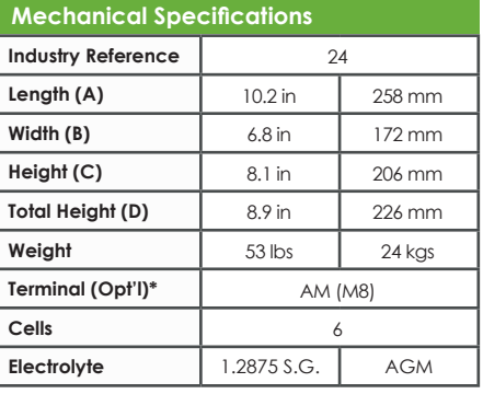
*TERMINAL TORQUE: Please refer to our document, located in the Resources webpage (www.discover-energy.com/resources/)